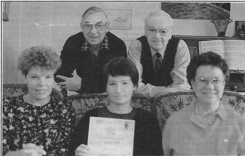
Milton Village View Team with their cheque and certificate.