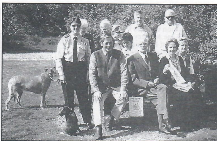
Friends of the Country Park and villagers meeting with Councillors at a recent event to promote the poop scoop laws