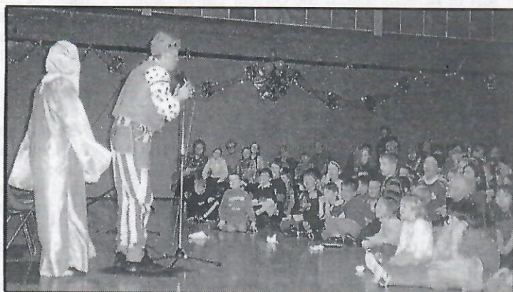
Panto time at the Community Centre

The Community Centre is taking bookings for 1999 and still has spaces for one-off events and a very few spaces for regular bookings.