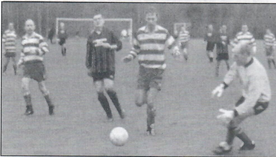
Milton and Histon dads battling it out in the cold and wet

What is now becoming an annual festive football fixture between parents of Milton Colts and Histon Hornets boys took place on Sunday 27th December 1998 at Sycamores Recreation ground. Despite shouts of encouragement such as "who shrunk the kit in the wash!!" and "the QE2 has a smaller turning circle than you", the Milton dads managed to give a good account of themselves.