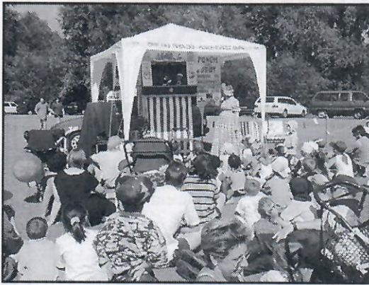
Punch and Judy