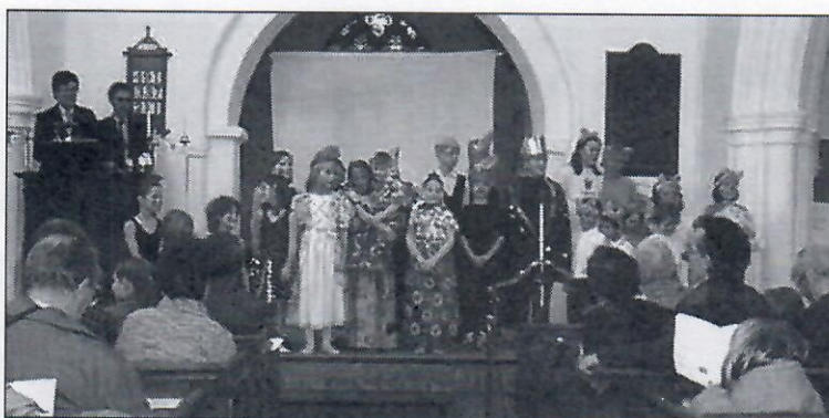
All Saints' Junior Church Christmas Presentation of 'Tatty Anna'. The retiring collection was for the 'Love Russia' project.