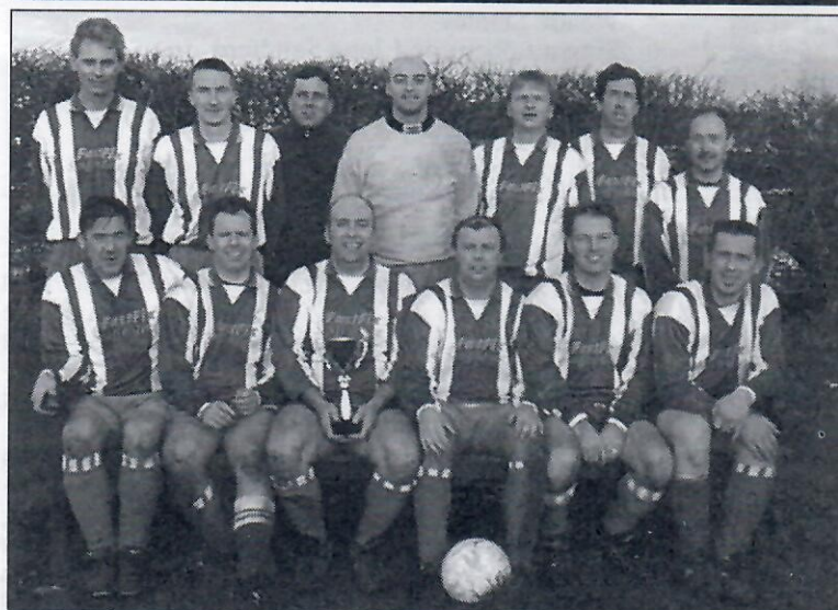
Milton Colts Dads