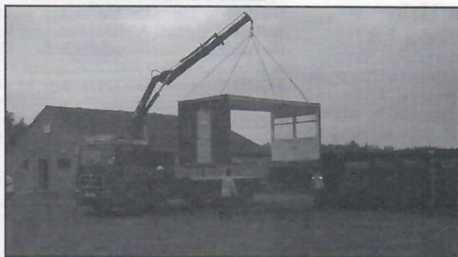
New Youth Building arrives at the Sycamores Recreation Ground