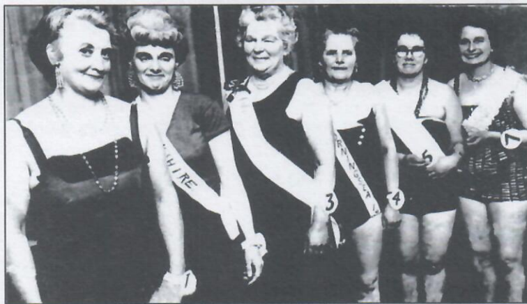
Milton W.I. 'Miss World Competition'