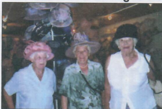
What fun we had trying them on