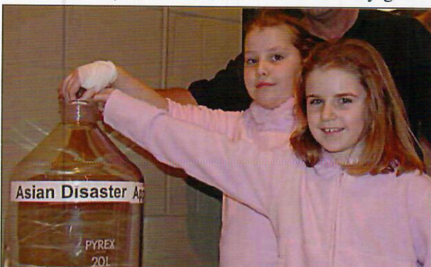
Children donated their piggy bank contents

Donations of hundreds of new gifts and Christmas presents for the Bring and Buy, raffle, bottle stall and auction flooded in and by Friday, the day of the sale, there were so many gifts it took almost an hour to