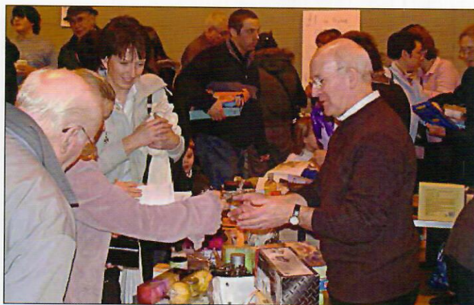
Peoples generosity was astonishing. Every trestle table the Community Centre had in the hall was in use and laden with donated goods. The volunteers reported that buyers were handing over money for goods and donating their change.