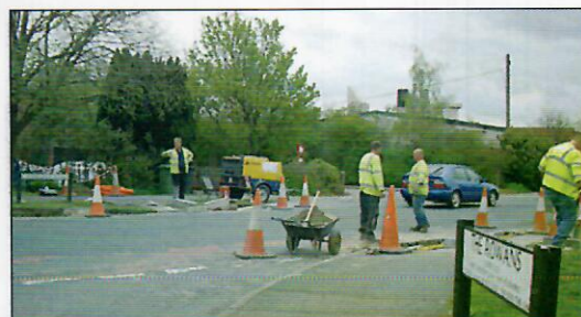
Installation of dropped kerbs outside Tesco's ready for zebra crossing

Bare ground round Milton Interchange hours a day on the interchange but at the moment no traffic lights are to be installed on the Milton entrance to the roundabout even though your Parish Council specifically requested that there should be.