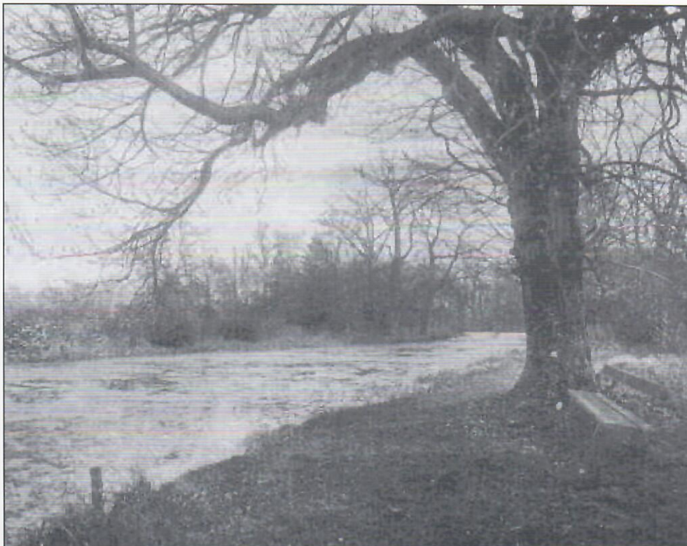
Milton Hall's Ornamental Lake or "New River"