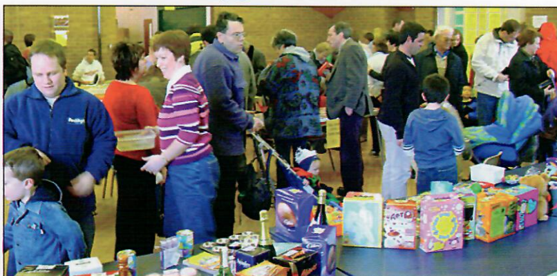
Cygnets Easter Fayre stalls

On Sunday 13 th March Milton Cygnets Pre-School presented its annual Easter Fayre. There was an abundance of stalls and games for all the family. One of the main attractions was our Easter egg wall where a lot of children won Easter eggs. (Thank you to everyone who donated eggs and raffle / tombola prizes.) The whole event raised over seven hundred pounds for Cygnets and was greatly enjoyed by both young and old.