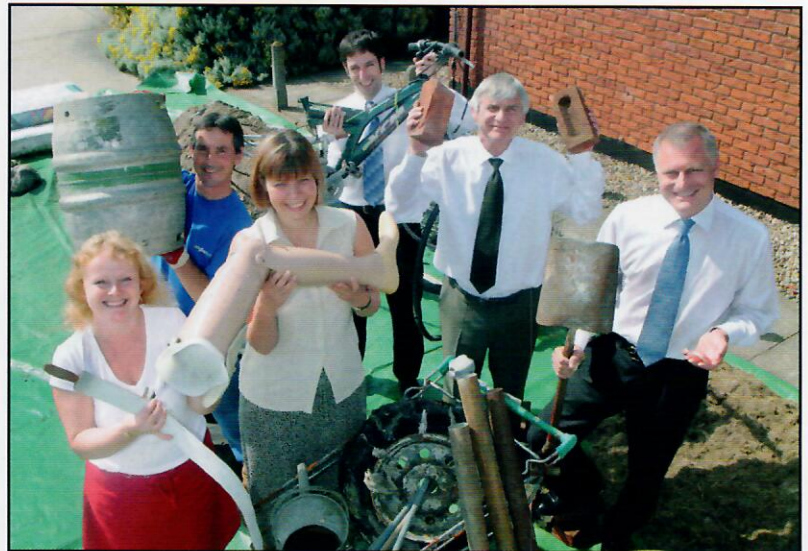
Some of the items removed from the sewerage system by Anglian Water

*A fat trap is a reusable container designed to encourage customers to collect and dispose of kitchen oils and fat, which can be used to make a nutritional food source for garden birds.