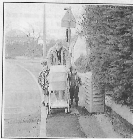
Cable Cabinet Causes Problems to Pedestrians

The relocation of this Cable Cabinet to a more pedestrian friendly position, indicates communications have improved between the Cambridgeshire County Council and Cambridge Cable. Previously a letter from Cambridge Cable stated the cabinet was in a position approved by the Cambridgeshire County Council.