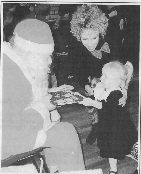
Father Christmas visits Mother and Toddler Group All Saints Church Milton

Three successful Christmas Parties were enjoyed by eighty mums with toddlers. The Tea and Chat group, for mums with babies under one year, shared a lunch together and also received a visit from Father Christmas.