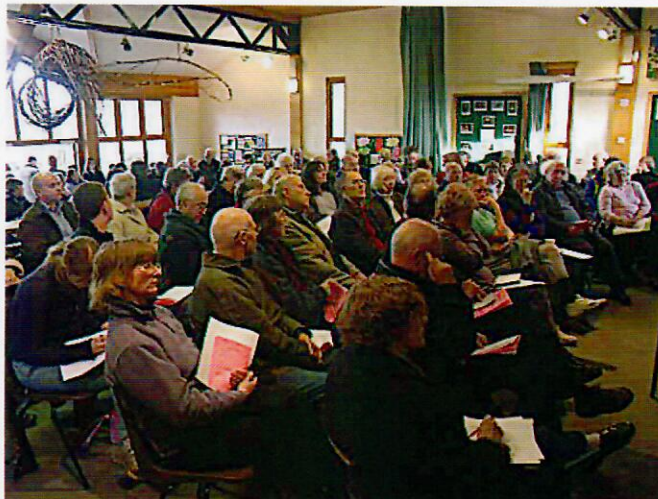
Meeting in the park