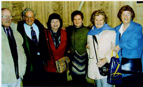
Our happy group outside the Albert Hall after the concert making their way back to the coach.