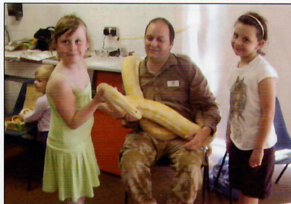
Snakes at the Fayre