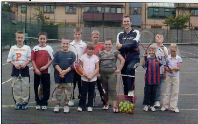
Some of the children who received coaching

The coaching was sponsored by Cambridge Electronic Design, the Milton Tennis Club and Milton Community Centre with refreshments provided by the staff of MCC and I think I can say that everyone really enjoyed these mornings, which for some, was their first experience of tennis.