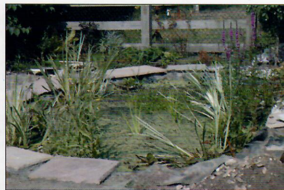
Transformed School Pond