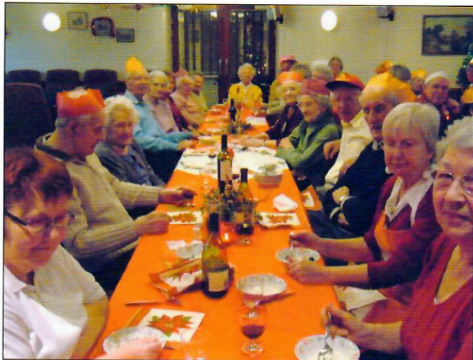
Christmas dinner at Milton Day Centre