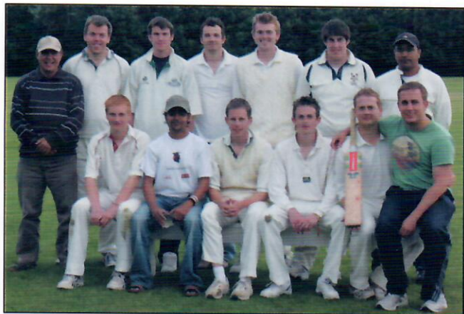
Milton 1st XI