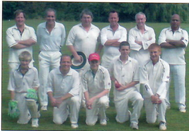
Milton 2nd XI