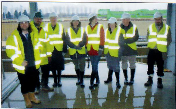
Group from Milton visiting the Donarbon Company

collections from the whole of Cambridgeshire. What is surprising is the detailed organisation that goes into dealing with each type.