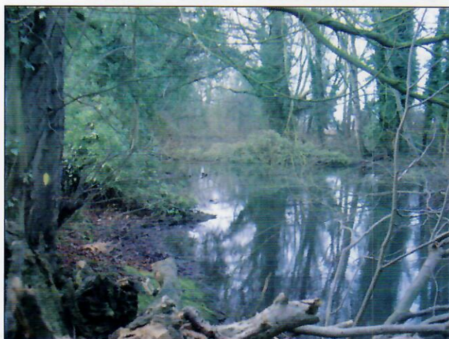
Lake at the back of Milton Hall known by some locals as the New River but on an old map it is named "Clytemnestra"

Page 2 Local news, Exposed by the Trowel Page 3 What's On, WI Report Page 4/5 Parish Council news, Old Milton Page 6 Religious, Medical, Hospice, Energy advice Page 7/8 Puzzle, Poetry, Chris Smith, Scrabble, Sport