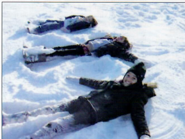
Pupils at Milton Primary enjoying the snow