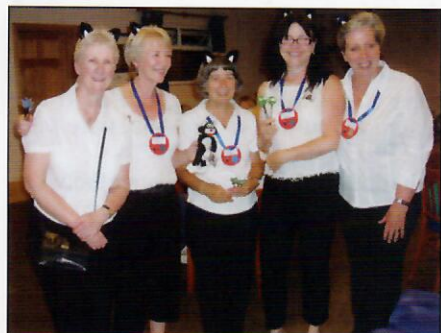
Our darts team on the evening they won the tournament