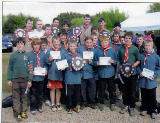
Some Milton Scouts and Explorer Scouts with the trophies they won at a recent County Activity Weekend at Mepal Outdoor Centre

Please visit our web site: http://www.50thcambridgescouts.org/