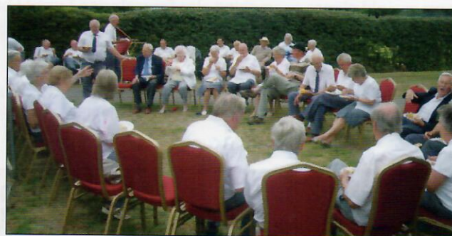
Members past and present enjoying buffet tea