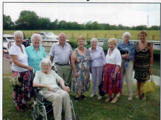
Some members by the river

On the 30th June Day Centre members and volunteers went on an outing for lunch at the Dolphin Hotel, St Ives. A cavalcade, consisting of the Community mini-bus and several cars drove in convoy through the villages avoiding the A14 to St Ives where we all enjoyed lunch. Weather wise it was a beautiful day so after the meal some of the party took advantage of the sunshine outside on the terrace by the river watching the boats passing by.