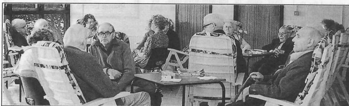
Day Centre members relaxing after lunch