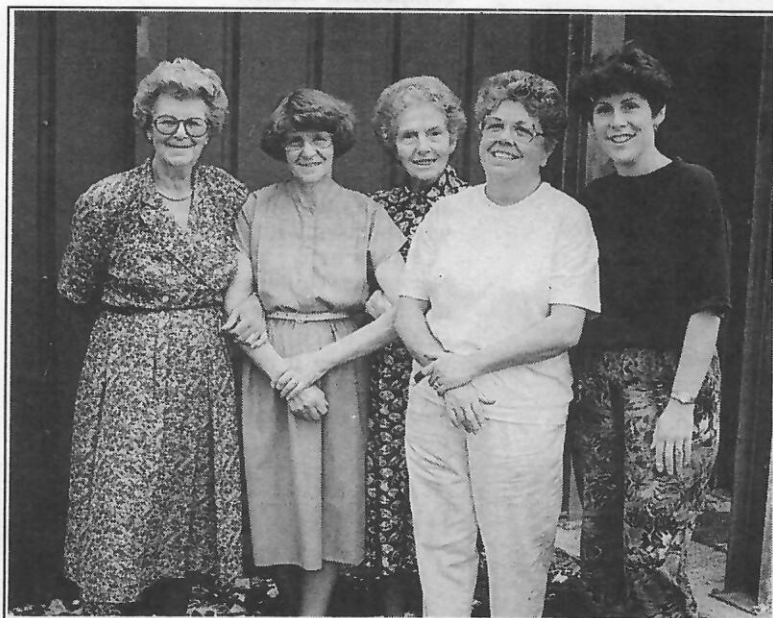
Some of the first day helpers