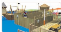
Adventure Port & Pirate Ship

Example views of the new play area in Milton