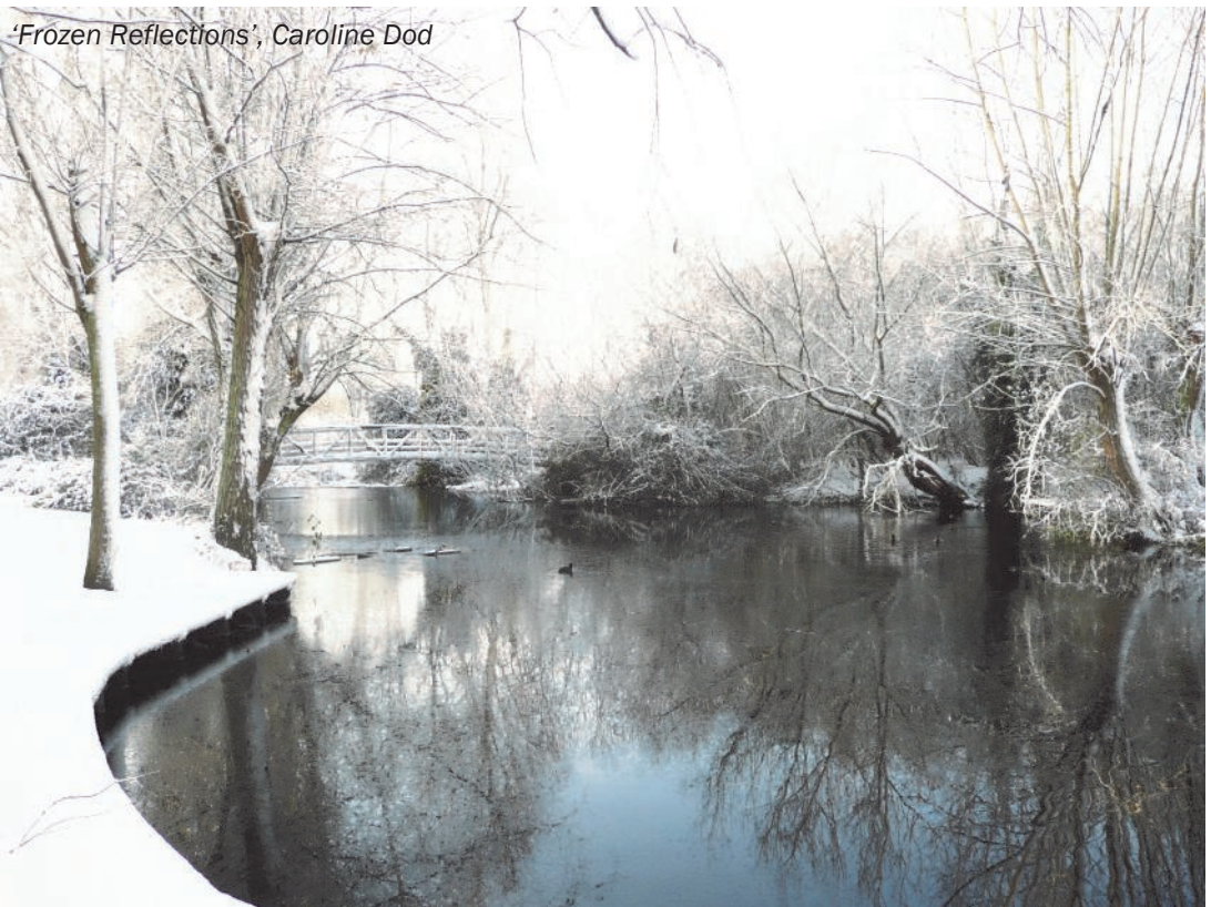
'Frozen Reflections', Caroline Dod