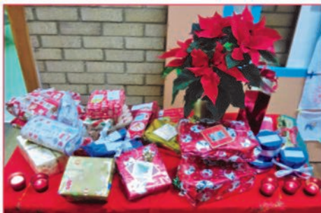
Christmas Gifts for Whitworth House from Milton M.U.

On 3rd February at 7.30pm the film The Vow will be shown in the church hall. There is no charge for admission. Refreshments will be served and there will be a retiring plate collection for the Mothers' Union. Lent sees the commencement of Lent Matters 2. Everyone is invited to join us at noon in the church hall for prayer, a talk and tasty lunch. On 1st April at 7.30pm we reflect upon the events of Holy Week by looking at the second part of the BBC film, The Passion .