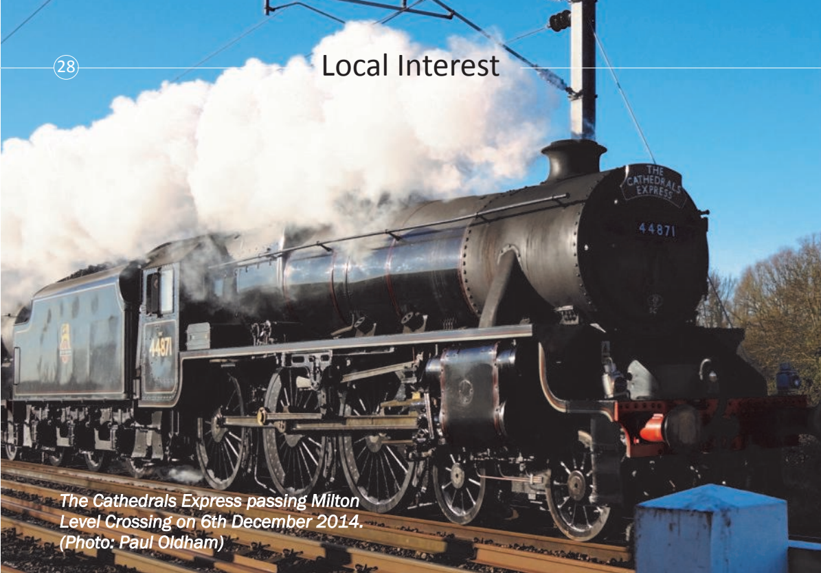
The Cathedrals Express passing Milton Level Crossing on 6th December 2014.