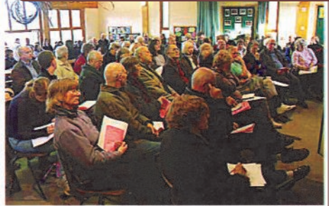
Meeting in the park