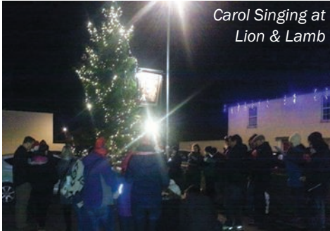
Carol Singing at Lion & Lamb

Everything's cosy here at the Lion & Lamb... we're open all day serving hot drinks: try our Salted Caramel Hot Chocolate with Marshmallows... yummy! Look for our New Year voucher which can save you up to £10 when dining. Our weekday meal offers, Steak Night, Pie Night and Fish Night are also available 6-9pm! Don't leave it too late to book for Valentine's Day, Mothers Day – 6 th March and Easter Sunday – 27 th March.