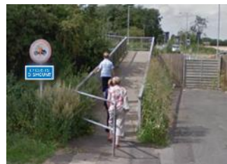
Butt Lane Bridge

Closing date for responses 24th February 2019