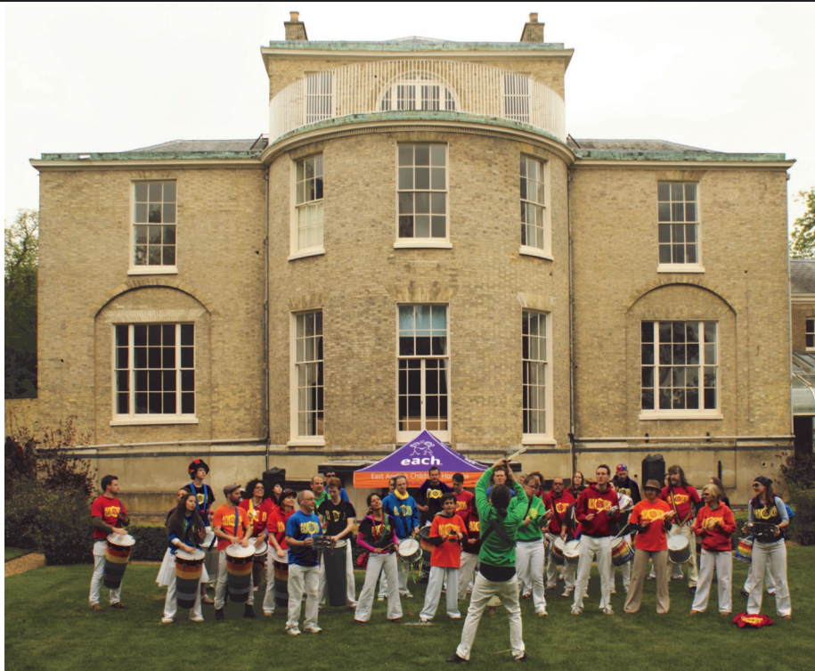
EACH Gala Day at Milton Hall

Magnolia on Fen Road