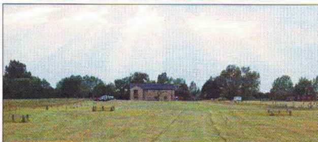
A view looking down the 9th fairway towards the clubhouse

A new 9 hole golf course is close to completion. The course, sited on the north edge of the village opposite the allotments, is due to open in late July. Once the club house is completed there will be a bar and restaurant 'The Cantabrigian' open to non members. There will be pay and play available and currently the owners are looking for 50 founder members. Founder members will pay £350 for a years membership. Usual membership fee £375, concessions £175 and juniors £80 with no joining fee.