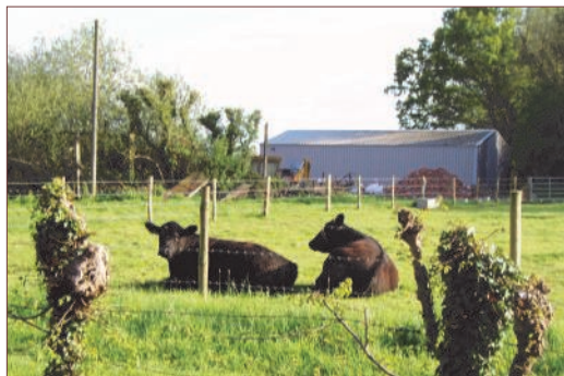
Cows on Ely Road