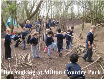
Den making at Milton Country Park