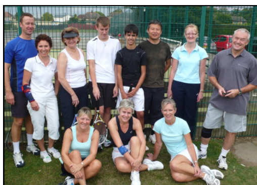
The Nick Lock Cup players