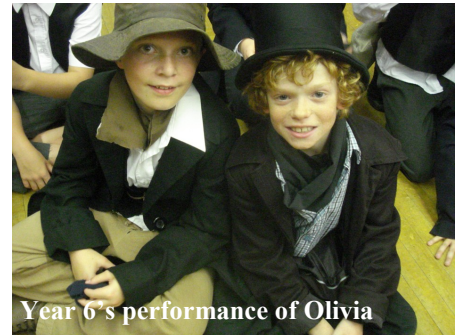
Year 6's performance of Olivia