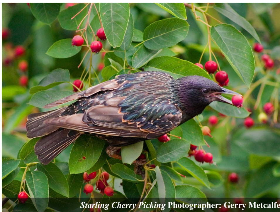
Starling Cherry Picking

Milton Photographic Club held their fourth annual exhibition at the village fayre in July.