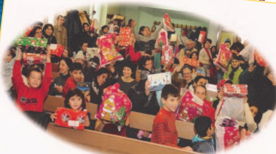
'Receiving their Christmas Shoe Boxes'

You may like to support these charities by buying their Christmas cards this year: the Mission to Europe cards show where our shoeboxes from Milton were sent last year! Email missiontoeurope1@gmail.com (£3.50 for 10 cards), or visit www.tlmtrading.com for The Leprosy Mission cards.