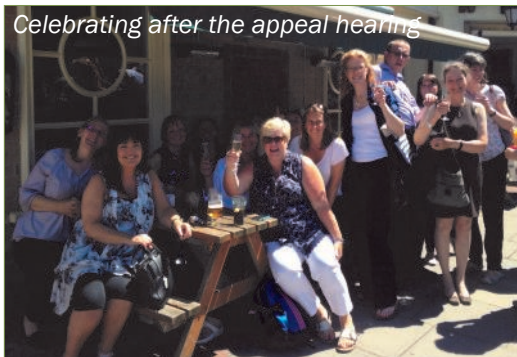
Celebrating after the appeal hearing