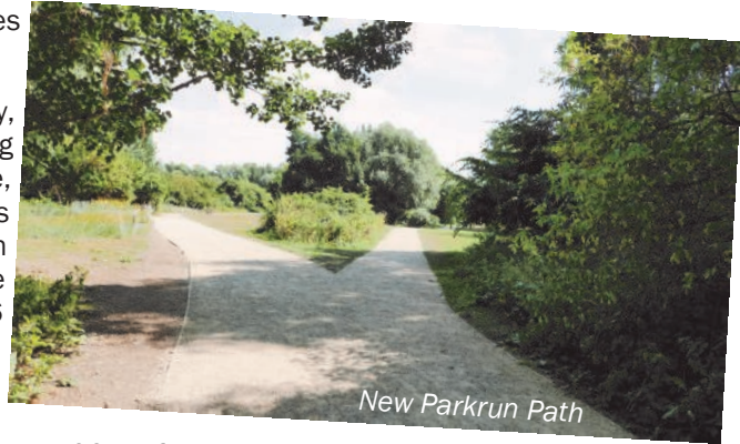
New Parkrun Path

We were awarded £34,669 by Amey, allowing us to refurbish the viewing balcony at the back of the visitor centre, the Hall's Pool bridge, the two bridges at Deep Pool and the viewing platform bridge, as well as resurfacing the disabled car park. With £40,258.26 awarded by WREN, we