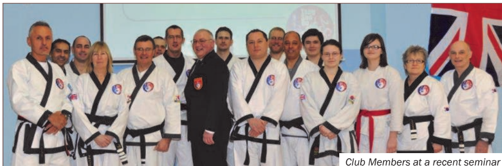
Club Members at a recent seminar

I taught the first class at this venue on 1 st October 1986 and we have trained there fifty weeks a year ever since (only closing at Christmas). On 1 st of October this year it will be our 30 th anniversary. Do you know if we are the oldest club in Milton?