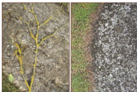
(Left) yellow lichen on a twig (Right) blue-grey lichen on a pavement