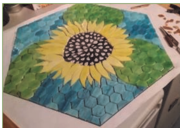
Examples of Mark Palmer's stepping-stone designs