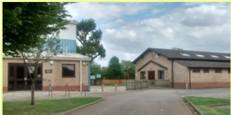
Milton Community Centre and Annexe