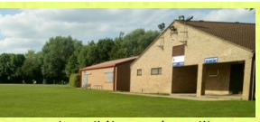
Youth Building and Pavilion