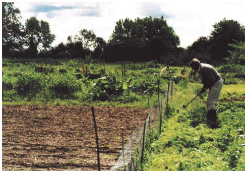
Allotments off Ely Road