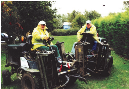
Grass cutting contractors

year occasionally contracted in other specialist advice such as HR advice, solicitors to act on our behalf, a building surveyor and a pitch consultant.